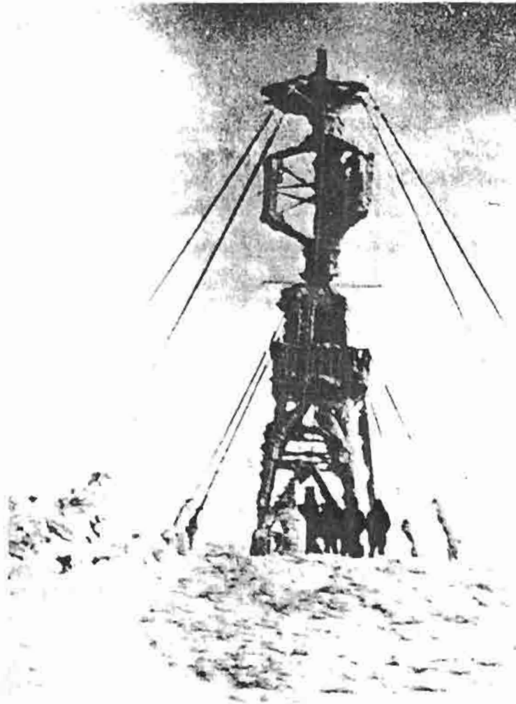
Fig 1b The icing phenomena set fourth special problems in the mountain sites: 6 kw giromill blocked up in the Lacauti mountain (1718 m height)